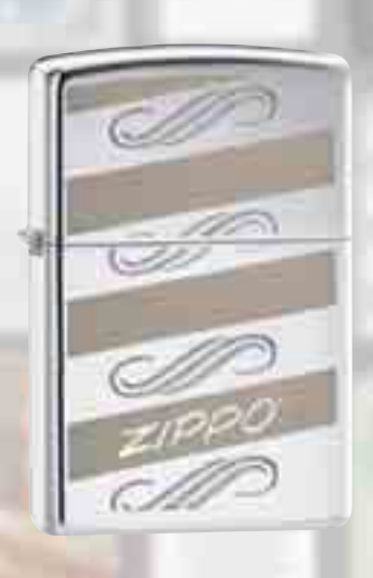
No. 24456 Windswept Zippo High Polish Chrome Suggested Retail: $27.95

A combination of laser and rotary engraving decorates these lighters with two distinctive looks. The delicate scroll and windswept Z add a touch of elegance.