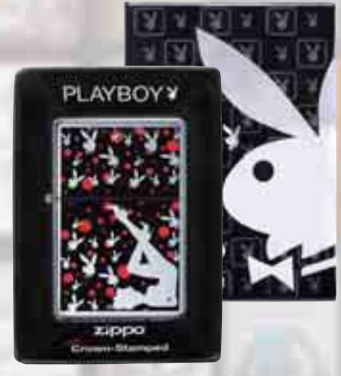
Packaging for the Playboy Crown-Stamped lighter

Available selected countries, some restrictions may apply.