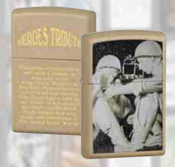
No. 24488 Museum Collection Heroes Tribute Cashmere Crackle™ Suggested Retail: $29.95

The most visited museum in northwestern Pennsylvania houses a treasure trove of Zippo images, icons, and memorabilia. From the 3,393 lighters that make up the American flag in the entryway, to the poignant sculpture of two soldiers sharing a light in a foxhole, to the sizeable