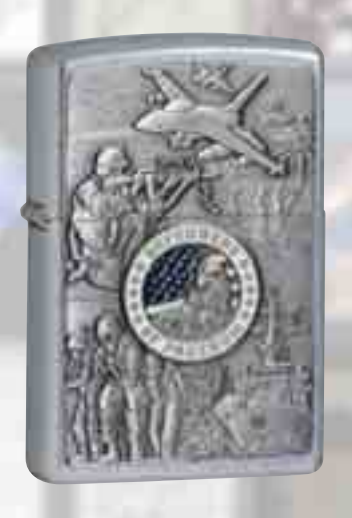
No. 24457 Joined Forces Emblem Street Chrome™ Suggested Retail: $36.95