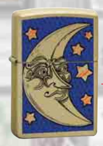
No. 24444 BS Face-Moon Honey Gold<sup>™</sup> Suggested Retail: $29.95