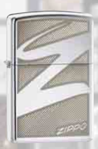
No. 24461 HT Windswept Z High Polish Chrome Suggested Retail: $27.95

A combination of laser and rotary engraving decorates these lighters with two distinctive looks. The delicate scroll and windswept Z add a touch of elegance.