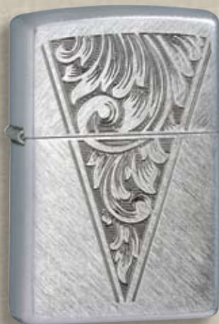
24904 Herringbone Sweep

The diagonally brushed surface of Herringbone Sweep provides an interesting contrast for intricate scrolled engraving.