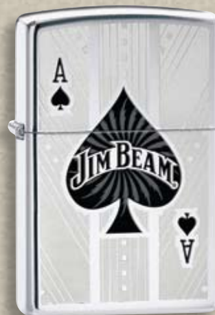
24945 High Polish Chrome

JIM BEAM is a registered trademark of Jim Beam Brands Co. and is used under authorized license to Zippo Manufacturing Company. All rights reserved worldwide. Intended for adults of legal purchase age for alcoholic beverages.