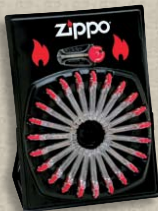
No. 2406C Six Flint Dispenser 24 per Display Card

For optimum performance of every Zippo windproof lighter, we recommend genuine Zippo flints and wicks.