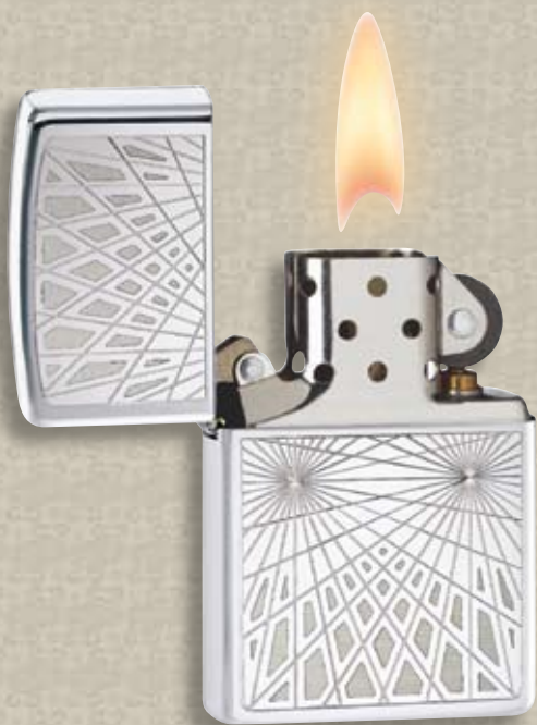
24903 High Polish Chrome