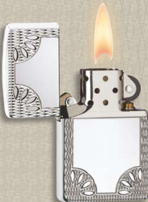
24953 Armor High Polish Chrome

A distinctive bottom stamp authenticates these lighter as heavy-walled Armor, about 1.5 times as thick as a standard chrome case.