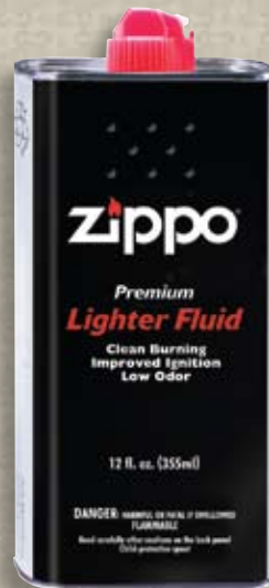
No.3165 Lighter Fluid 12 oz. (shipping carton of 24) (No. 3365 carton of 12)

For optimum performance of every Zippo windproof lighter, we recommend genuine Zippo fluid, flints, and wicks. For optimum performance of every Zippo BLU™ butane lighter, we recommend genuine Zippo premium butane gas and flints. For all Zippo multipurpose lighters, we recommend genuine Zippo premium butane gas.