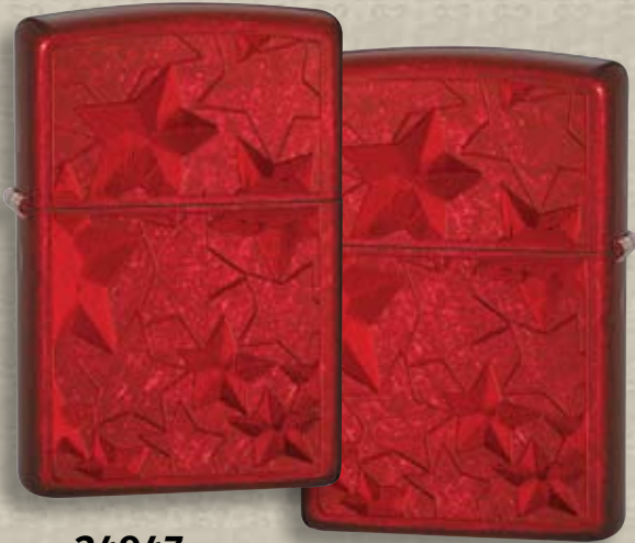
24947 Candy Apple Red

Zippo's Iced process highlights multi-faceted engraving layered with a translucent powder coat to give the illusion of looking through a thin sheet of ice. Design is on both front and reverse surface of the lighter. May be imprinted over Iced surface for a truly unique look.