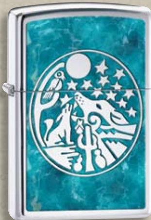
24941 High Polish Chrome

Zippo's innovative color imprint / chromed-out combination process replicates the look of a high quality enameled emblem right on the lighter surface.