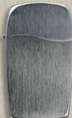
30001 Vertical Chrome

See our Complete Line Catalog for the full line of Zippo BLU lighters and accessories.