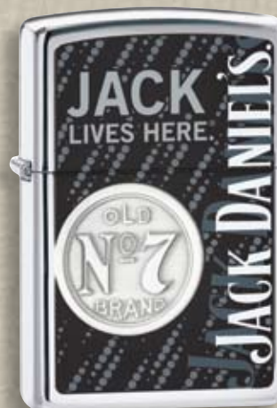
24899 High Polish Chrome

Zippo's innovative double lustre / color imprint combination process showcases several Jack Daniel's logos in shades of black, gray and white around a double lustre Old No. 7 brand.