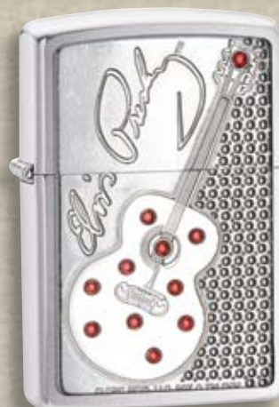
24841 Brushed Chrome Emblem

Made with CRYSTAL LIZED SWAROVSKI ELEMENTS