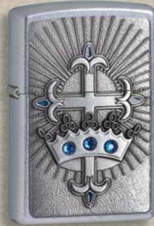
24875 Street Chrome Emblem

Made with CRYSTAL LIZER™ SWAROVSKI ELEMENTS