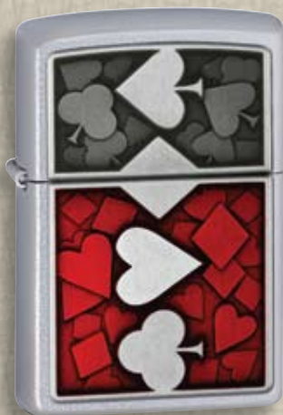
24850 Satin Chrome Emblem