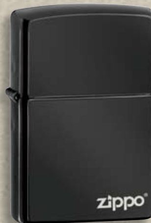
24756ZL Ebony with Zippo

Available with or without laser engraved Zippo logo.