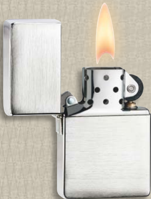
1935.25 Brushed Chrome

Like the original, the 1935 Replica features a three-barrel outside hinge joining the lid and bottom, an open hollow rivet that secures flint wheel to inside unit, and a flat bottom case. A unique bottom stamp identifies the 1935 Replica.