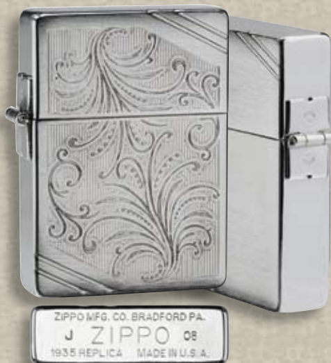
24944 Brushed Chrome

Elegant engraving embellishes the face of a bright brushed chrome 1935 Replica characterized with corner slashes both front and reverse, and a distinctive bottom stamp.