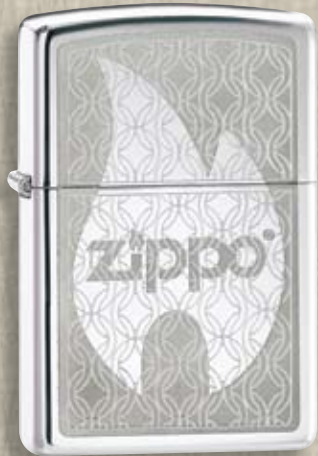
24942 High Polish Chrome