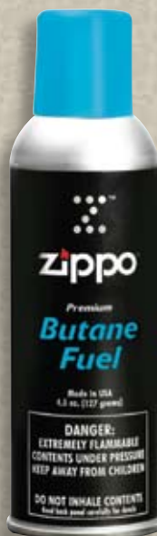
No.3800 Butane Fuel 4.5 oz. (shipping carton of 48 with 8 innerpacks of 6)