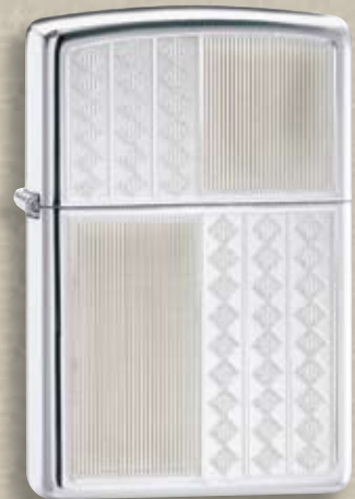
24851 High Polish Chrome