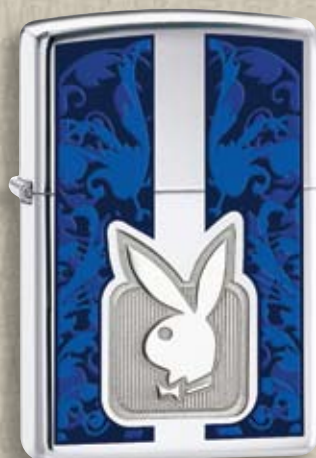
24927 High Polish Chrome

Zippo has framed a striking double lustre Playboy Rabbit Head logo with a shades-of-blue background for a rich, sophisticated look.