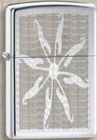
24852 High Polish Chrome