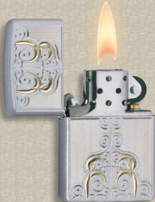
24906 Satin Chrome

Ford Oval and nameplates are registered trademarks owned and licensed by Ford Motor Company.