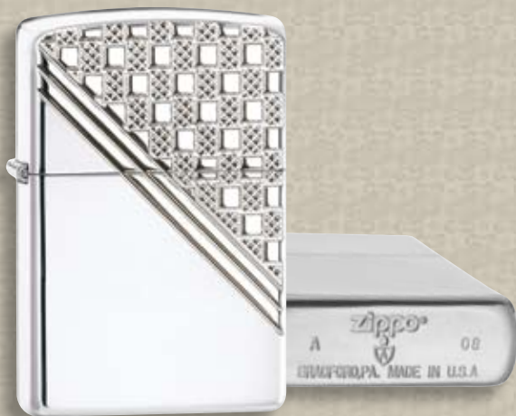
24952 Armor High Polish Chrome