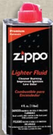
No.3141 Lighter Fluid 4 oz. (shipping carton of 24) (No. 3341 carton of 12)