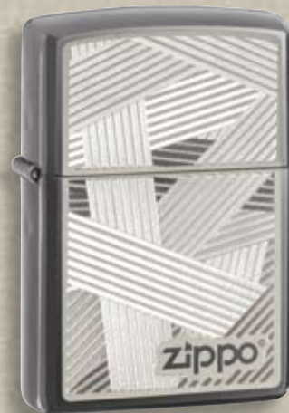
24943 Black Ice®