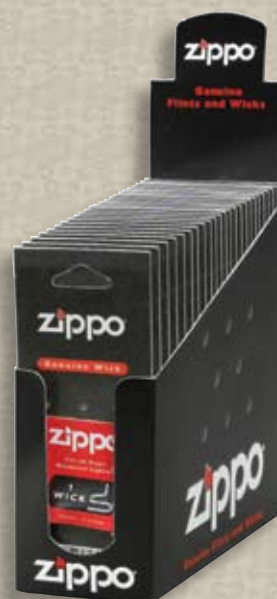
No. 2425 Wick Cards 24 cards per display box; 24 boxes per master carton